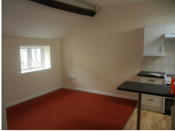
Living area of new flat

The owner had bought an empty commercial premise to provide a larger business space for themselves and they were very keen on creating, from the space above the shop, a one bedroom residential unit to provide a much needed home for a local person.