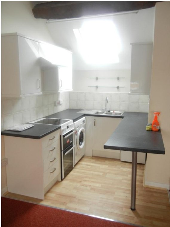
Installed kitchen in new flat

The tenant who had been allocated the property was then able to move into their new home.