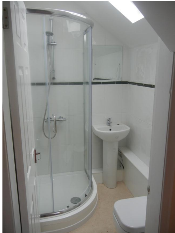
Newly created shower room